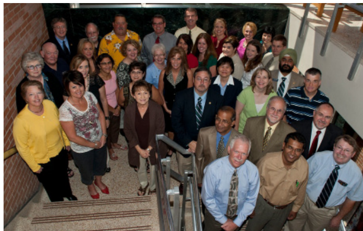
2011-2012 SWOSU College of Pharmacy Faculty, Staff and Administration

The SWOSU College of Pharmacy Administration, Faculty and Staff individual profiles can be found on the SWOSU COP website ( www.swosu.edu/academics/pharmacy ).