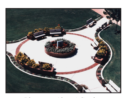
Pharmacy Alumni Garden

McAlester, Big Spring/Odessa, Dallas, Stillwater, Abilene, Fort Smith, Lawton, and Guymon.